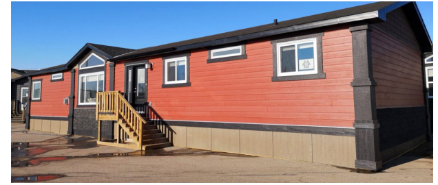
Actual home not exactly as pictured.