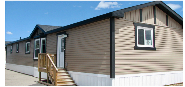
Actual exterior colour of home is gray.